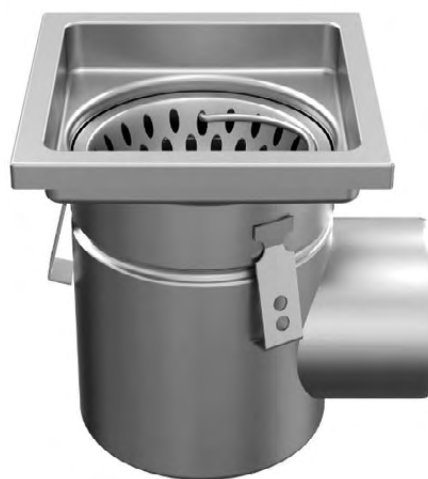
Horizontal outlet DN75 or DN110