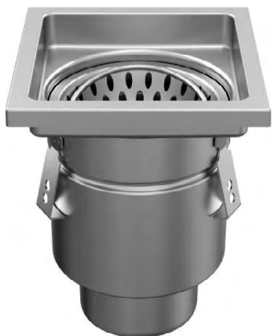
Vertical outlet DN75 or DN110

ATT stainless steel floor drain features: